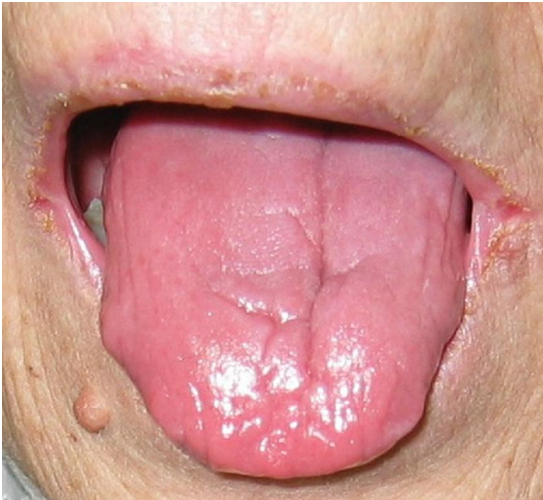
Fig 1 Depigmented red tongue and angular cheilitis