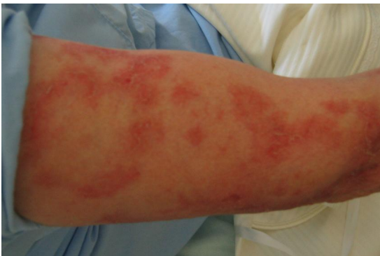
Fig 2 Annular erythema associated with Sjögren syndrome (also called Ro associated cutaneous lesions or subacute lupus-like lesions)