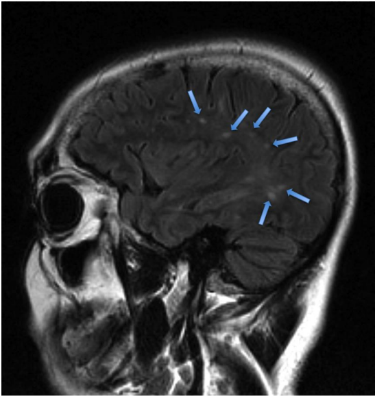
Fig 4 Magnetic resonance image of demyelinating central nervous system lesions (multiple sclerosis-like)